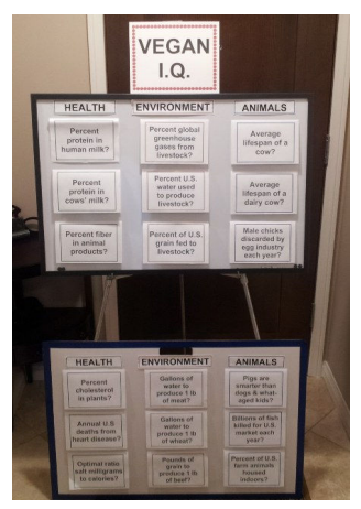
Two 2' x 3' Whiteboards

Give a small prize (e.g., sponsor coupon) to each participant as a reward for playing.